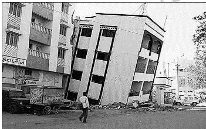
More than ninety percent of the buildings in Bhuj have developed cracks and have become dangerous to live in.

AID is accepting donations to support the earthquake relief efforts in India. 100% of the funds collected by AID will be sent directly to the affected areas. AID will achieve this by sending your contributions to grassroots voluntary organizations in Gujarat with which it has been already associated in developmental efforts with great success. Through AID projects, we have established a good rapport with these organizations and are fully confident that your contributions will be effectively utilized for relief efforts. You CAN make a difference. You can mail your donation check to the AID postal address given overleaf. Please write "Gujarat Earthquake relief" in the check. For further information regarding the Gujarat earthquake relief efforts, please contact AID at: Phone: 301-422-2232, 301-422-7765 & Email: rajeevnpn@wam.umd.edu . You can also donate through a credit card. Please see the website www.aidindia.org/gujarat for more details.