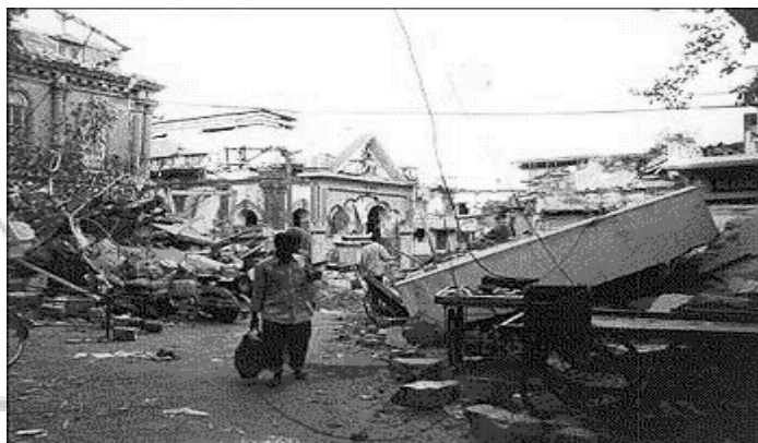
Relief workers search the rubble for survivors.

It is difficult to relate to the scale of misery being experienced by thousands who were injured and the now millions of homeless survivors. AID is raising funds in the US to support the ongoing relief efforts. An appeal for support from SEWA, an NGO in Gujarat with which AID has collaborated on an earlier project, along with a detailed relief budget, is available at the website http://www.aidindia.org/gujarat .